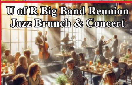
U of R Big Band Reunion Jazz Brunch & Concert