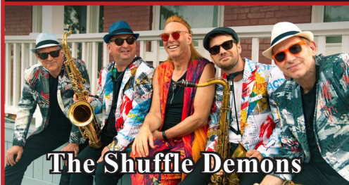
The Shuffle Demons