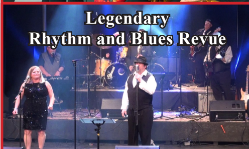
Legendary Rhythm and Blues Revue